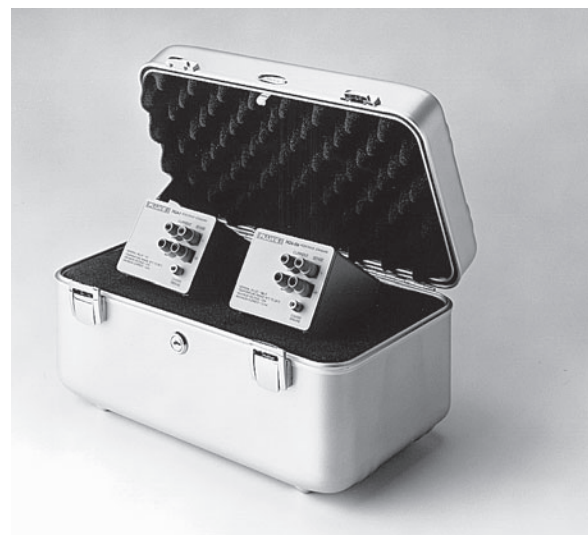
Optional 742A-7002 transit case

Fluke. Keeping your world up and running.