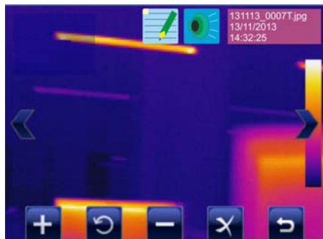
Vocal and textual annotations