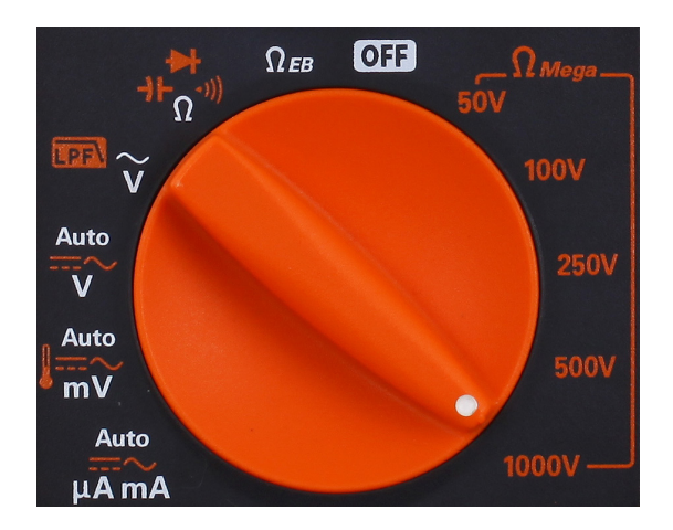
Figure 6. Insulation resistance tester with full featured DMM