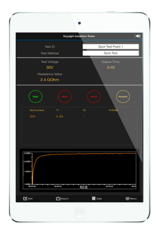
Figure 2. Perform remote testing with Keysight InsulationTester Application