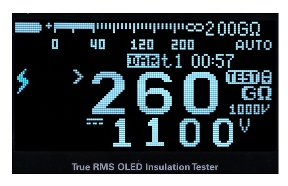
Figure 5. Adjustable insulation test voltage up to 1.1 kV

The adjustable insulation test voltage from 10 V to 1.1 kV in 1 V steps on selected two models¹ allows you to set precise test voltages catered to unique test application requirements. These typical applications are commercial avionics testing, military communications system testing and production line testing. The standard test voltages from 50 V to 1 kV is also available for selected models².