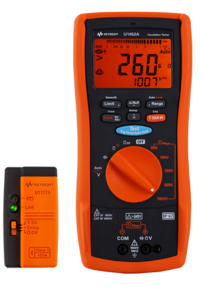
Figure 4. U1117A IR-to-Bluetooth Adapter enables wireless remote testings with the U1450A/U1460A series