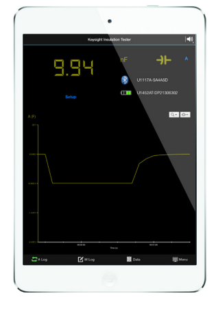
Figure 3. Data logging interface on Keysight Insulation Tester Application