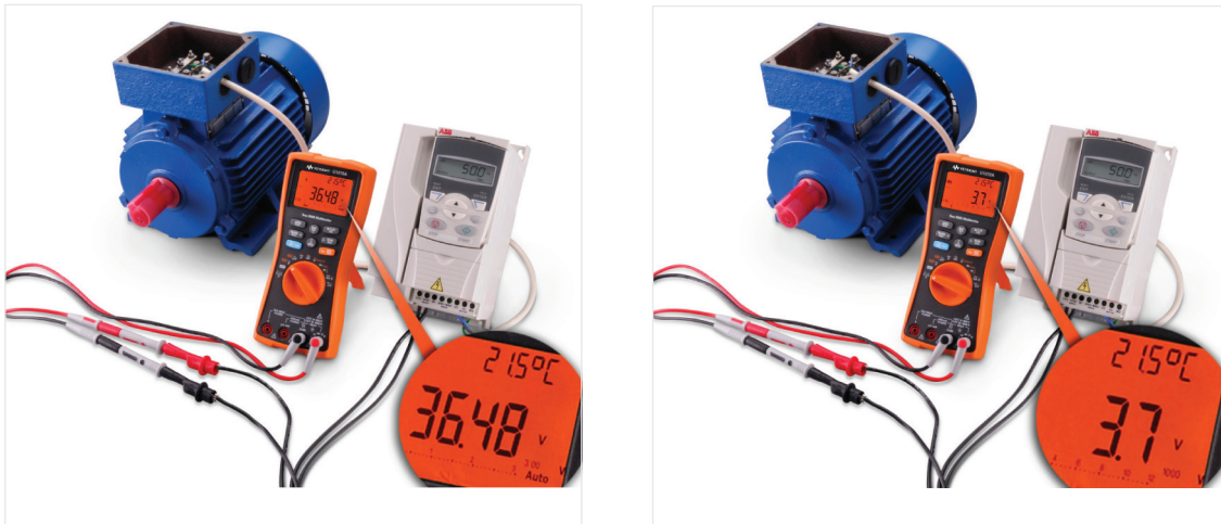
Figure 2. U1272A helps you identify the presence of stray voltage on a disconnected wire running parallel with the wire powering up the VFD to an industrial motor. The image on the right shows the U1272A in low impedance mode.

The peak detect function allows you to capture the engine or motor startup transient as fast as 250 \mu s.