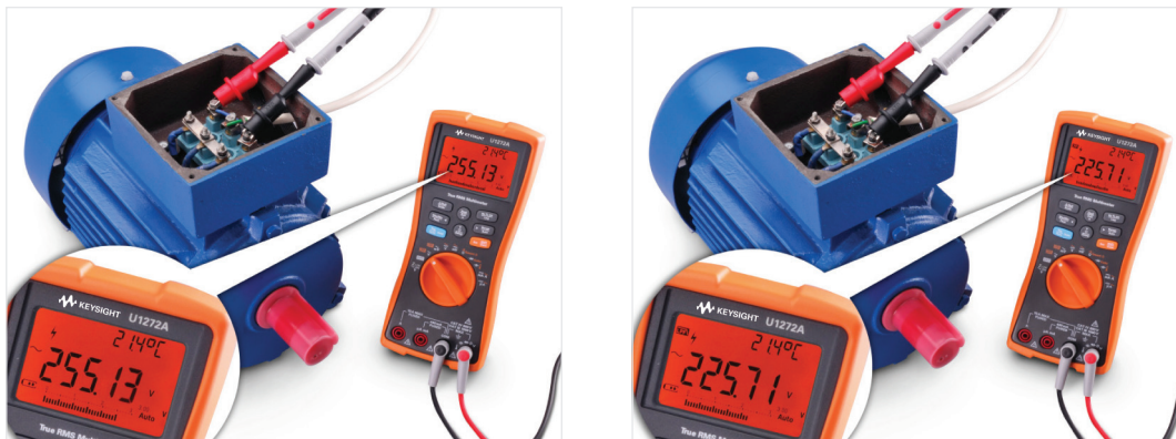
Figure 1. Comparison of voltage output from industrial motor VFD without and with Low Pass Filter functionality.

The U1270 Series offers a 1 kHz LPF or Low Pass Filter to provide accurate Variable Frequency Drive (VFD) output measurements. This function eliminates high frequency noise and harmonics, ensuring motor filter efficiency.